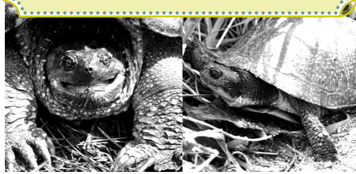
Below (Left to Right): Snapping & Blanding's Turtles