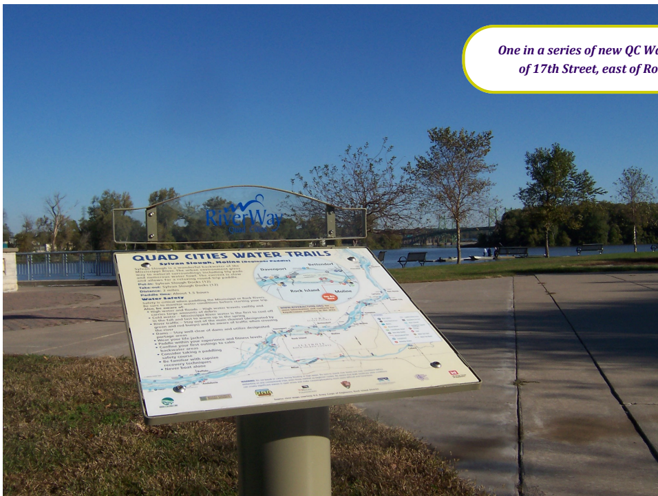
One in a series of new QC Water Trails Signs, Foot of 17th Street, east of Rowing Club, Moline.